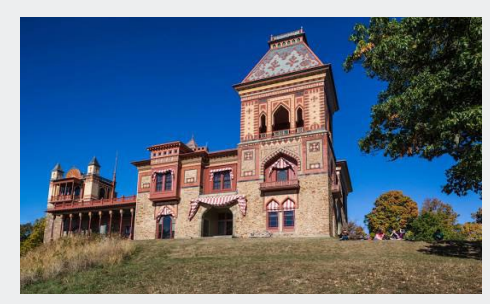
Olana State Historic Site

Bakers Falls is a waterfall on the Hudson River in Washington County, New York. It is located in the Village of Hudson Falls. Located on the river between Moreau and Hudson Falls.